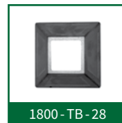
1800 - TB - 28